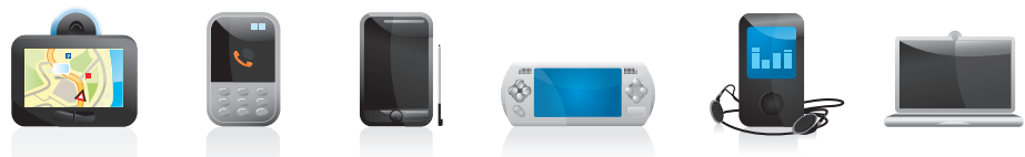
IQnav tests a growing number of multi-function wireless devices with GPS.

For CDMA-equipped handset models, the IQnav has dedicated input and output triggers for synchronization with handset testers. This allows for seamless testing of assisted GPS (A-GPS) handsets.