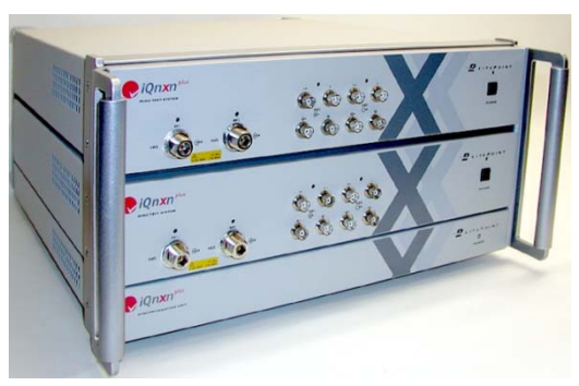
Figure 1. IQnxn<sup>plus</sup> MIMO Test System (2x2 Starter Kit configuration)

Please contact your local LitePoint Sales Representative for further information and a demonstration. For a current list of local sales resources, go to <u>www.litepoint.com</u> and click Contact.